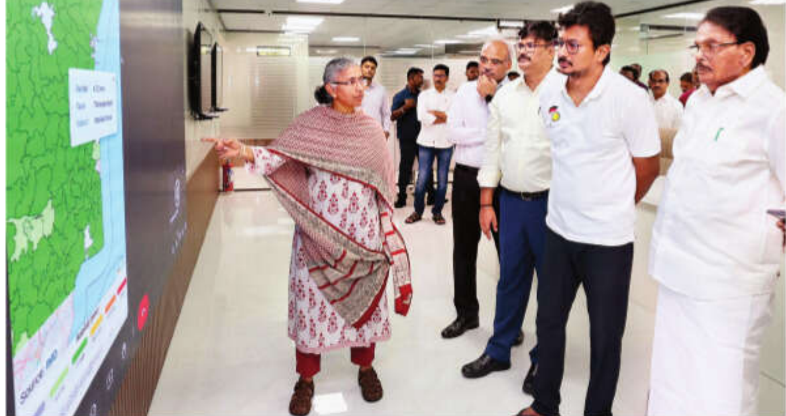
சென்னையில் உள்ள மாநில அவசரகால செயல்பாட்டு மையத்தில் வெள்ளிக்கிழமை ஆய்வு மேற்கொண்ட துணை முதல்வர் உதயநிதி ஸ்டாலின்...

அதிகாரிகளுக்கு துணை முதல்வர் உதயநிதி அறிவுறுத்தல்